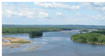
Wisconsin Geological & Natural History Survey

Also, the Air Quality Work Group analyzed a proposed air quality bill that would have removed important protections. The Fisheries Work Group provided comments to the DNR on the Proposed Program Guidance for the Angler Recruitment, Retention, and Reactivation Program.